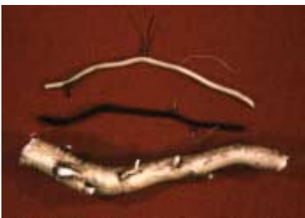
Figure 6: Top to bottom: Healthy feeder root; Dead feeder root; Large perennial root.