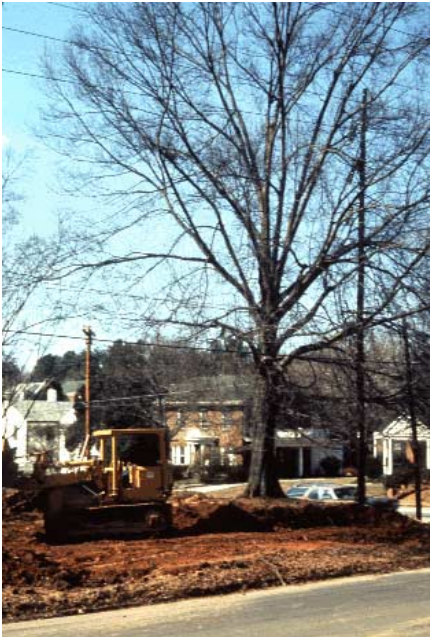
Figure 3: Root destruction, soil removal and soil compaction from construction equipment.