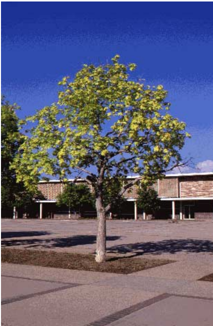
Figure 5: Yellow chlorotic foliage from root disease.