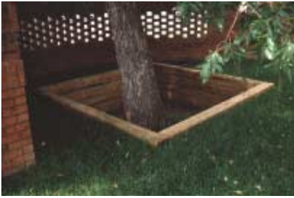
Figure 2: Addition of soil over roots cannot be compensated for by tree wells.