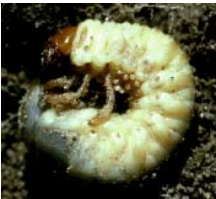
Figure 3: White grub larva.

May and June beetles ( Phyllophaga spp., Polyphylla spp.). These are the largest of the white grubs. Most injury by these insects occurs along the Eastern Plains, particularly in the southeast area of the state. Most May and June beetles have a three-year life cycle (Figure 5). Adult beetles emerge during May and June and lay eggs in the soil. Grubs that hatch from the eggs feed during the summer and move deep in the soil to overwinter. Grubs return to the root zone and feed throughout the following summer. May and June beetle grubs cause most injury during this second season of their life cycle. During spring and early summer of the next year, the grubs complete development, cease feeding, and turn into pupae and adults that remain inactive in the soil. Adult beetles emerge next season. Because of their large size, lawn injury by May or June beetle grubs can occur from populations of five or fewer grubs per square foot. Problems can result from a rarely seen small species of white grub, the black