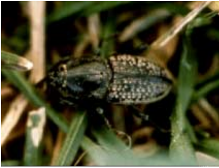
Figure 1: Denver billbug adult.