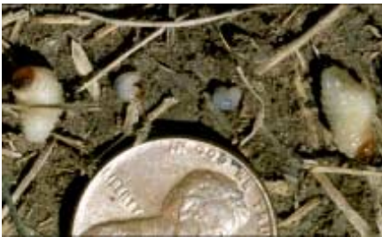
Figure 2: Denver billbug larvae.

wasps, fungal diseases, and parasites. Also, insect parasitic nematodes ( Steinernema species, Heterorhabditis species) are effective against both larvae and adult stages of billbugs and may be used as an applied biological control. (Insect parasitic nematodes are discussed in fact sheet 5.573, Insect parasitic nematodes . The nematodes are available from many mail order suppliers and several nurseries. Controlling billbugs with insecticides is difficult when they are in the larval (“grub”) stage. Young larvae are protected within the plant and older larvae occur in the root zone where insecticides fail to penetrate. Best control for the bluegrass billbug occurs when sprays are applied in early May to kill adult insects prior to egg laying. Current information on the Denver billbug indicates that a slightly later timing, in early June, is more appropriate. Apply adult sprays so insecticide residues remain as long as possible on foliage and in the crown area of the plant. This may be achieved better with liquid sprays than with granular formulations. Insecticides recommended for billbug control are summarized in Table 1.